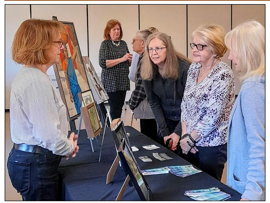
Artists presentation. In March artists From the Kanata Civic Art Gallery spoke to us and showed some of their work. (Story on page 6)