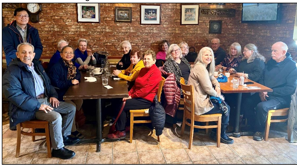
International Dining. My Thai Village Restaurant was the venue for our February rotating International Dining series.

To volunteer or if you have donation questions please email us at <a href="mailto:council@kanataseniors.ca">council@kanataseniors.ca</a> or call us Monday through Friday 9am to Noon at 613-254-7164.